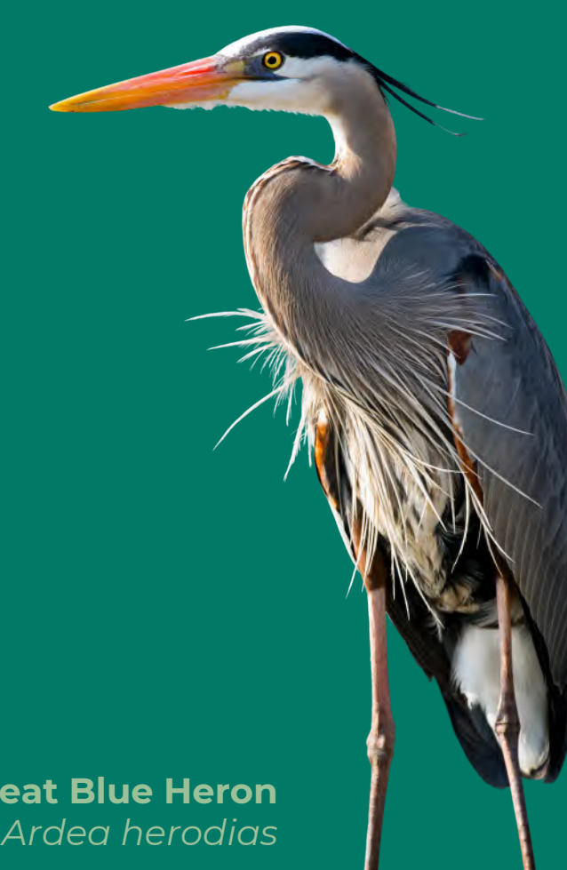
Great Blue Heron Ardea herodias