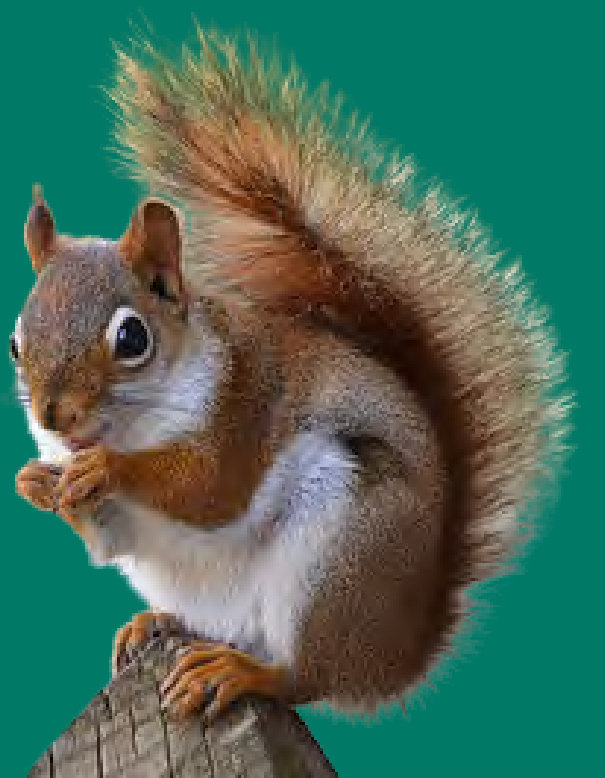
American Red Squirrel Tamiasciurus hudsonicus

For emergency services (fire, ambulance, police) please dial 911 You are at 390 Forestview Crescent, Renfrew Ontario To report an issue with the trail please contact the Town of Renfrew at 613-432-4848. For after-hours public works related emergencies please contact the Town of Renfrew's Emergency Dispatch Centre at 613-432-6446.