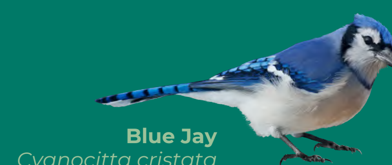
Blue Jay Cyanocitta cristata