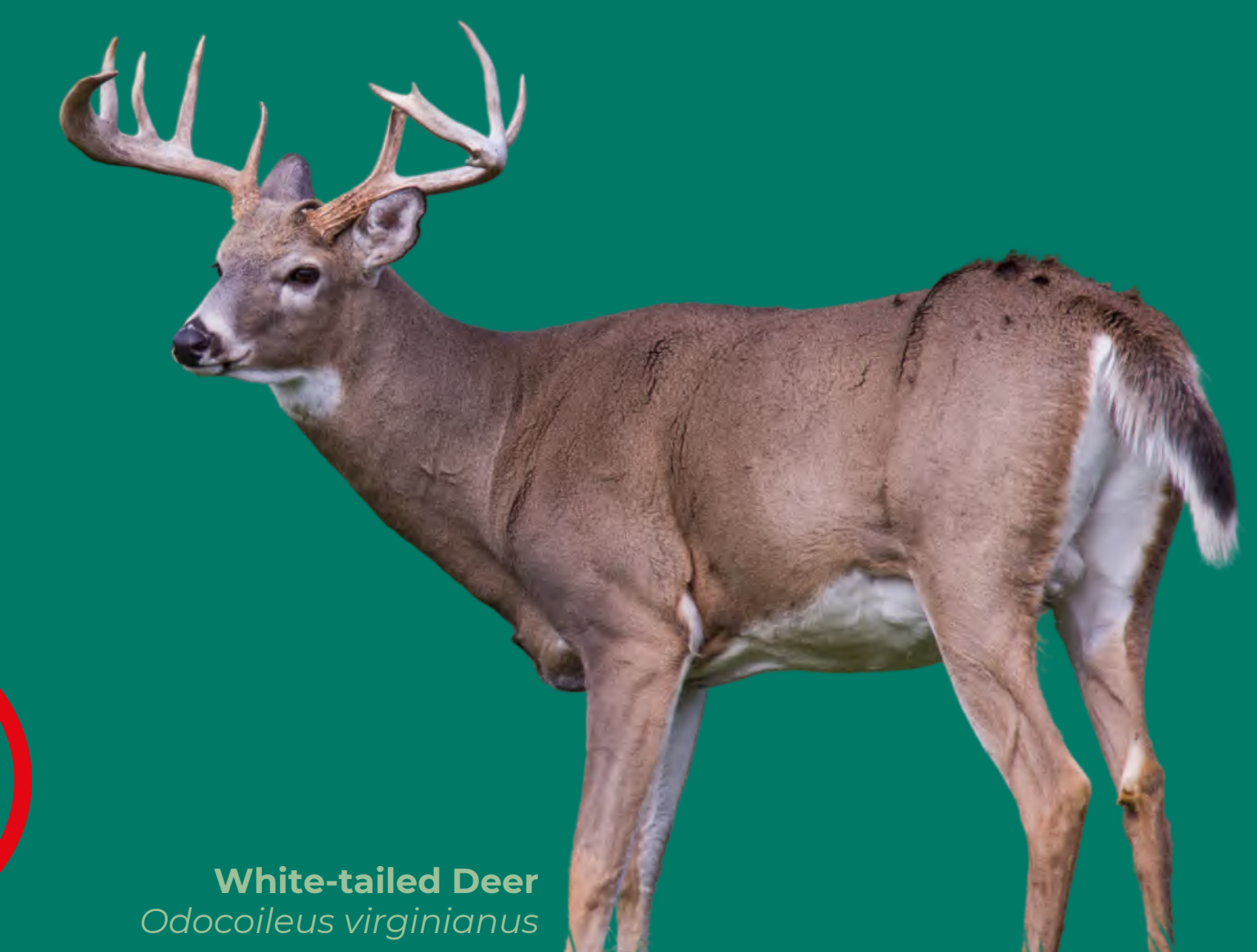
White-tailed Deer Odocoileus virginianus