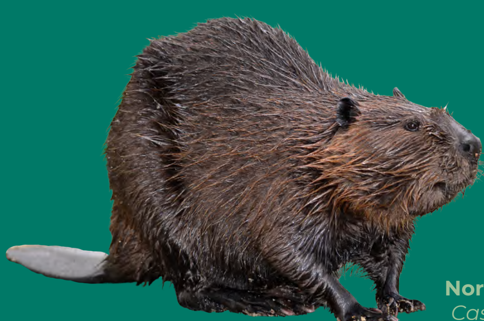
North American Beaver Castor canadensis

For emergency services (fire, ambulance, police) please dial 911 You are at 390 Forestview Crescent, Renfrew Ontario To report an issue with the trail please contact the Town of Renfrew at 613-432-4848. For after-hours public works related emergencies please contact the Town of Renfrew's Emergency Dispatch Centre at 613-432-6446.